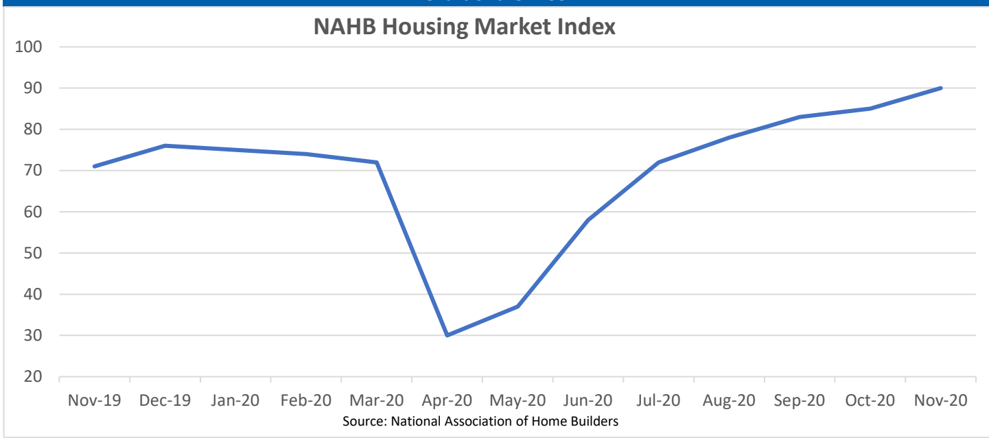
Chart of the Week